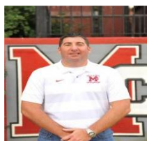
Senior Class Administrator