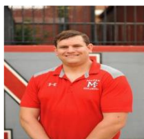
Junior Class Administrator