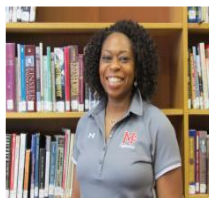
Freshman Class Administrator