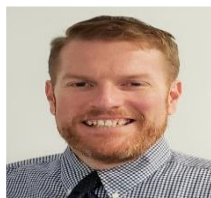
Sophomore Class Administrator